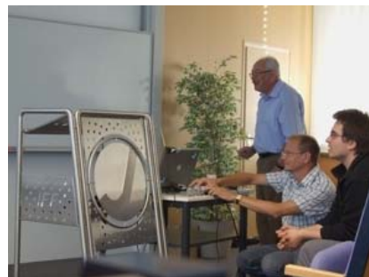
Fig. 2 Peter Grünberg presenting his talk about spintronics

For the students the course was a chance to come into direct contact with current research topics in nano electronics and also to learn about the research opportunities in JARA-FIT. More information about the JARA-FIT Lab Course Nanoelectronics including a booklet with the lecture notes and the descriptions of the experiments can be found under: http://www.fz-juelich.de/ibn/Nanoelektronik_Praktikum/